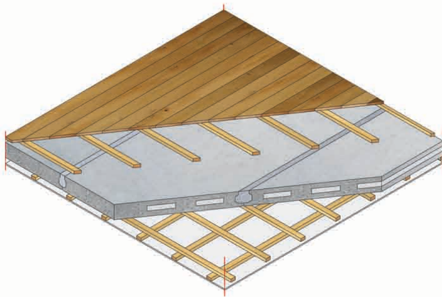
A. Slab with Timber floor Finish