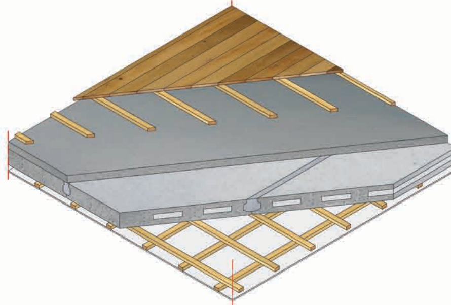
B. Slab with Structural Screed and Timber floor Finish