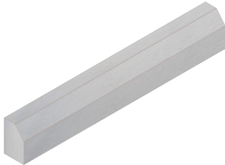
Intermediate Kerb (6" x 4")