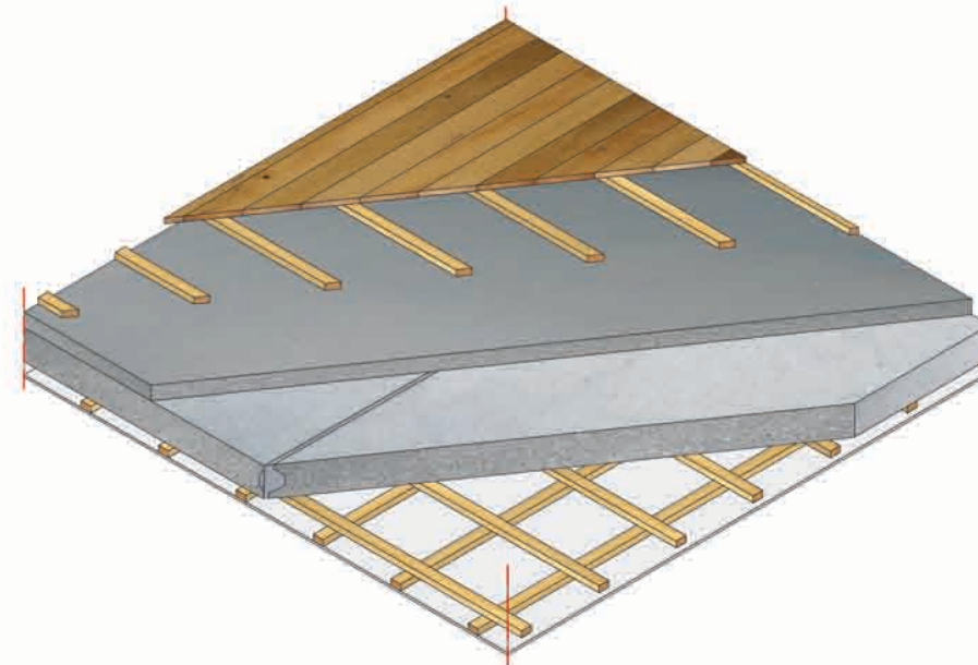
B. Slab with Structural Screed and Timber floor Finish