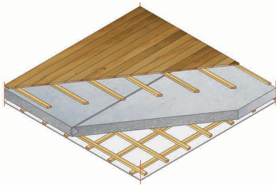
A. Slab with Timber floor Finish